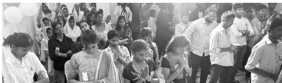
Youth Camp at St. Paul's Matriculation School Campus

By God's abundant grace, several ministry events were successfully conducted last month at St. Paul's Matriculation School