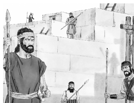
The fear of the LORD fell upon all the kingdoms

his heart was not fully devoted to the LORD his God, as the heart of David his father had been. Throughout Scripture, we encounter many fathers whose failure to leave a godly heritage brought ruin upon their children and subsequent generations. In stark contrast, kings like Asa, Jehoshaphat, and Josiah deliberately followed in their fathers' footsteps, establishing enduring legacies of faith. Their obedience not only blessed their own households but also brought peace to neighboring nations - 2 Chronicles 17:10 declares, ... The fear of the LORD fell upon all the kingdoms of the lands around Judah, and they did