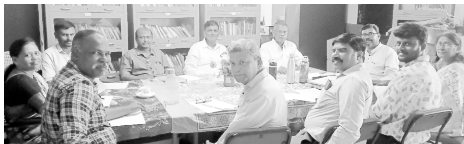
The Faculty Meeting of Nehemiah Bible Colleges.

co-workers, brothers, and sisters in Christ for their tireless efforts in making this project a great success. May the Lord richly reward your prayers, offerings, and sacrifices. Please be assured of our earnest prayers for you and your families.