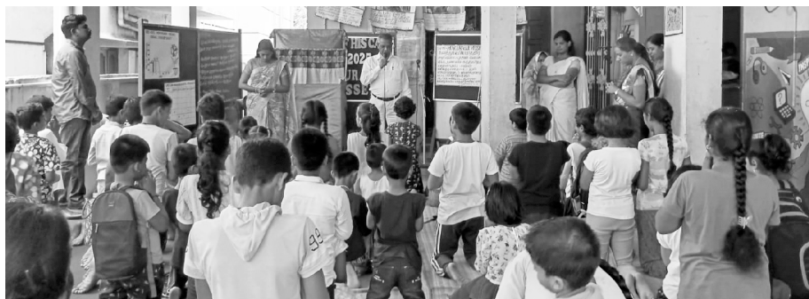
Vacation Bible School in Santhosahpuram

We thank God for the abundant blessings poured out during our Vacation Bible School conducted for the children in various places during the months of April and May. We are sincerely grateful to all our