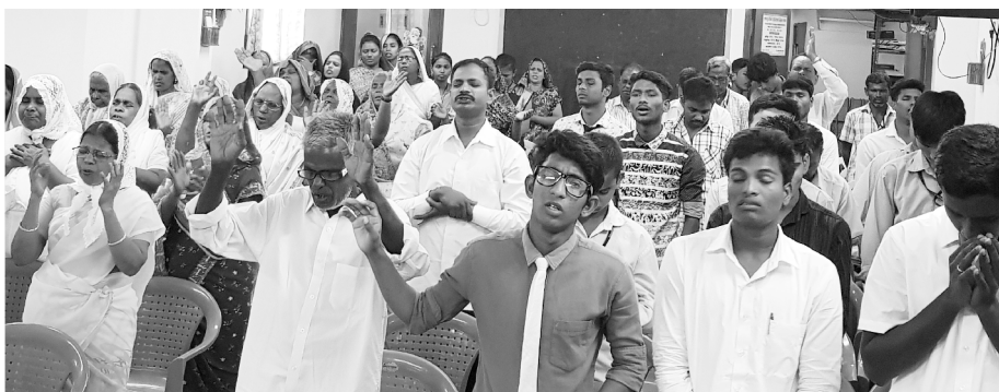
Key Leaders gathered for monthly prayer in Church

Hundreds of committed individuals have faithfully laboured in these diverse areas. Our key leaders continue to gather monthly for