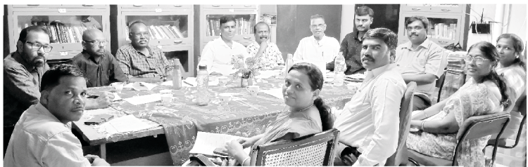
Nehemiah Bible College Board Meeting

India. We ask for God's blessings to shower upon you, your family, and your country.