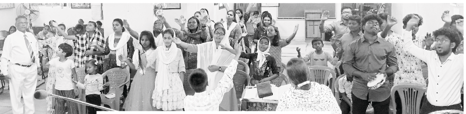
Children and Youth Rally

We hosted a special Children and Youth Rally on March 3rd, 2024, at the campus of St. Paul's Matriculation School . Approximately 100 members attended the program, which included special songs, testimonies, and messages.