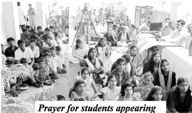
Prayer for students appearing Public Examination

We regularly meet with young children every Sunday after the church services. These children are raised in God's way. We are in need of more students, good teachers, and leaders for our St. Paul's Matriculation School and Nehemiah Bible Colleges in Hindi and Tamil languages. Additionally, we require more readers for the monthly newsletter, Echo of His Call , in all 16 languages. Please provide us with more addresses of your friends and relatives, so we can send Echo of His Call in their own languages free of cost. We also need more readers for Echo of His Call in Urdu language. Your assistance in any way, big or small, will be greatly appreciated, and you will be rewarded by God.