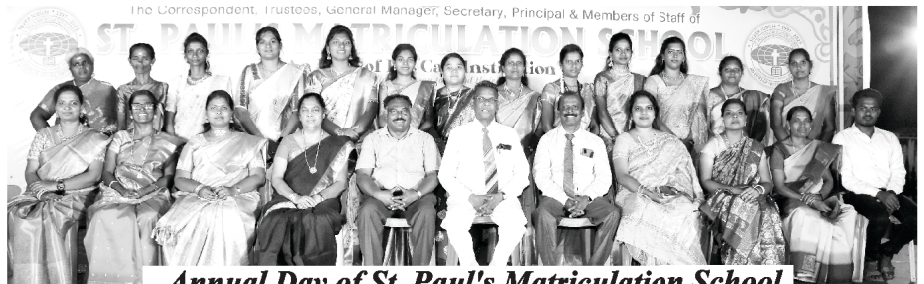
Annual Day of St. Paul's Matriculation School

We are pleased to report the success of the Annual Day Celebrations at our St. Paul's Matriculation School , which took place on March 2nd, 2024. The students showcased their talents during the event, and it was attended by many parents, children and residents from the surrounding areas. It resembled a convention and deliverance meeting, and we are grateful for your ongoing prayers.